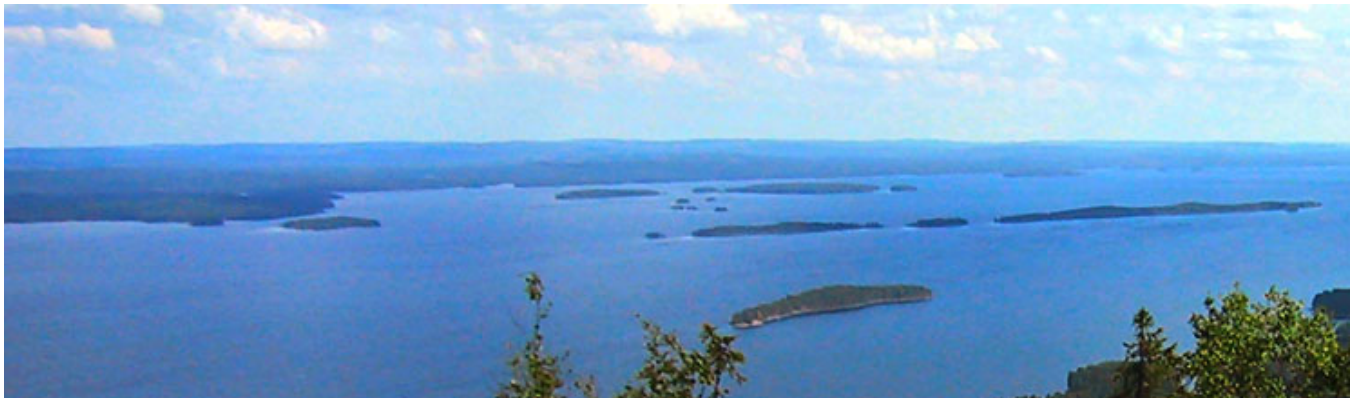
Koli Finland - June 16-19, 2010 - Ideologies and Ethics in the Uses and Abuses of Sound